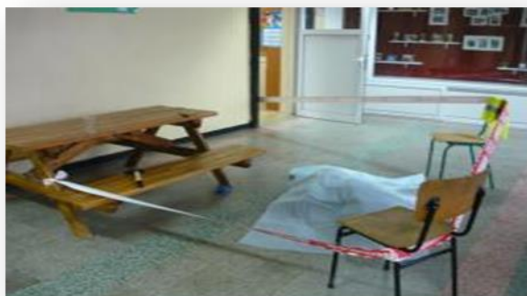
Young crime scene investigators in action

Teachers and students demonstrated SCI techniques using materials from the Toolbox